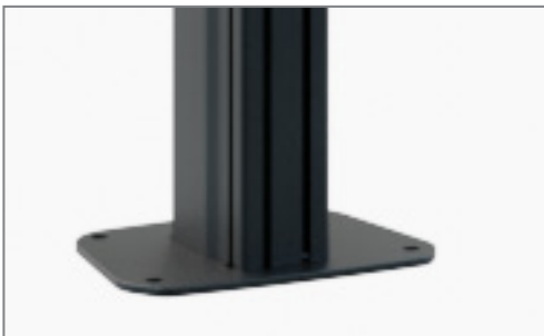
Space saving floor-wall mounting