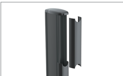
Hidden cable routing along the pillars